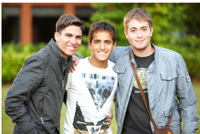
Updated April 2026 AF

Some of our students have special dietary needs such as halal food. This requirement would be made clear at the time of matching and is subject to an additional payment. It is not a requirement for hosts to accept students with special diet needs.